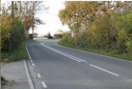
From 40mph sign towards entrance to Waungiach