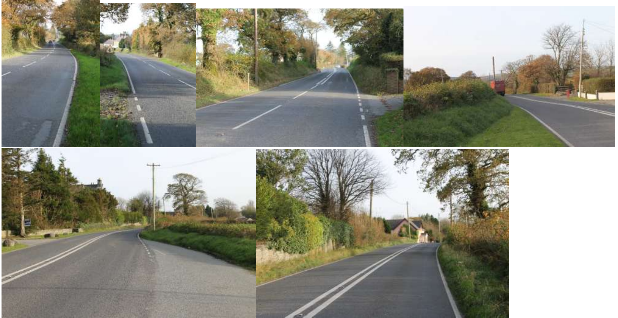
Photographs taken between Croes Y Llan crossroads on the A484, walking towards Llechryd prior to the 40mph limit. Illustrates the poor visibility