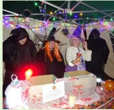
A treat in store for those who braved the Halloween trail / A treat in store for those who braved the Halloween trail

Halloween was marked by a trail around village culminating in a reward of sweets in the Council stall at the Coach House. The Christmas tree and lights at the Coach House proved a focal point for several events. The Council set aside funding for events to take place in June 2022, to celebrate the Platinum Jubilee of HM Queen Elisabeth II