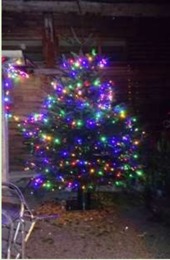
Christmas erected by the Community Council at the Coach House/ Christmas erected by the Community Council at the Coach House