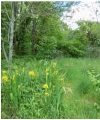
Y Pinog, Mehefin 2021 The Pinog, June 2021