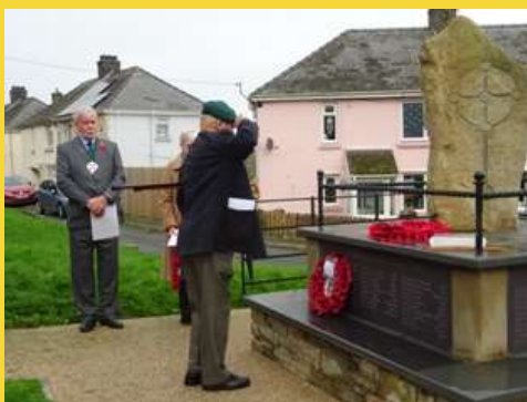
Wreath laying at the War Memorial/ Wreath laying at the War Memorial

The Red Ensign was raised, in September, at Glanteifion to mark the sacrifice of those who served in the Merchant Navy during WWI and WWII.