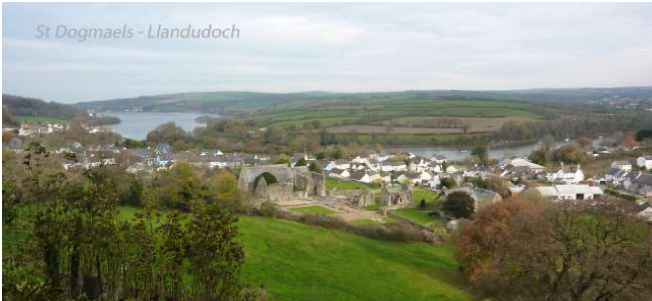
Views across St Dogmaels

Cyngor Cymuned Llandudoch St Dogmaels Community Council