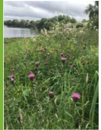
Y Pinog / The Pinog

To support and improve Biodiversity in the village the Council carried out a study of all its land and in 2021 agreed to carry out a 3-year pilot programme based mainly at the Pinog. Where possible, taking into account land usage and other geological aspects, the existing cutting regime was adjusted aiming to improve the chosen sites for pollinators and other wildlife. Initial results have already seen an increase in native wild flowers and pollinating insects using the pilot areas. With Covid restrictions lifted it is hoped to involve residents in future monitoring surveys.