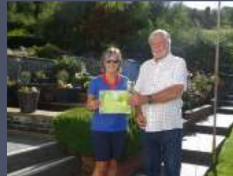
Presentation by the Council Chairman to a Village in Bloom winner/ Presentation by the Council Chairman to a Village in Bloom winner

Despite the issues presented by COVID the Community Council once again ran its popular In Bloom competition but in a new photographic format